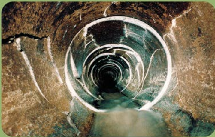
The SPR II can operate with 2000' of video to inspect 7" pipe through 72" diameter pipe.

The unit is designed to operate with all CUES inspection systems with up to 2000' of single-conductor or multi-conductor cable to inspect 7" relined pipe through 72" diameter pipe. The unique built in two (2) speed transmission doubles the torque of the unit to produce maximum pulling power in large diameter pipe when the 10.5" diameter tires are installed.