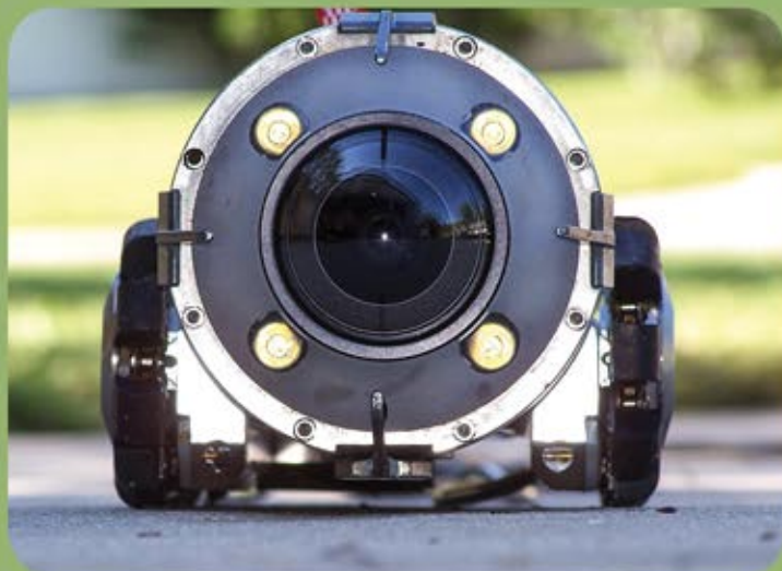
The SPR II can operate with the CUES Digital Side Scanning Camera (DUC).