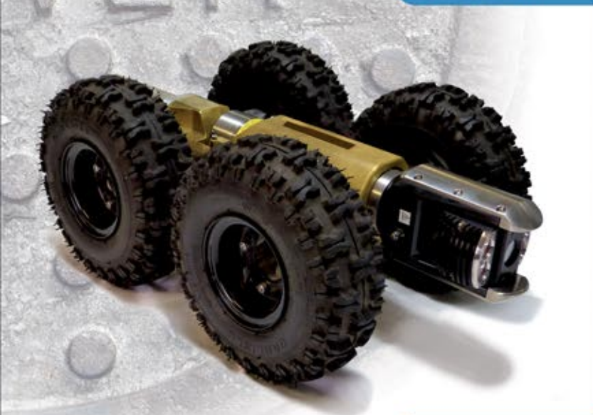
18" - 72" Knobby