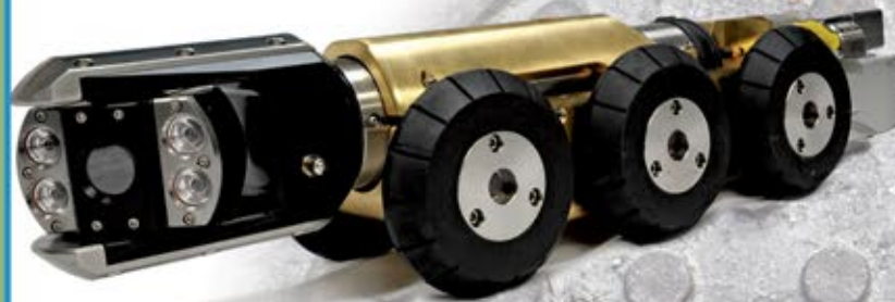
10"- 15" Rubber